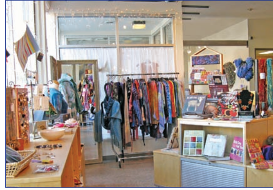
Textile Center Shop