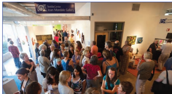
Joan Mondale Gallery

There are three types of members at Textile Center: individual, organizational and business members. While each member type has unique benefits, they all help support the creative development of fiber artists and sustain the textile community, as well as enjoy opportunities to network with other textile and fiber organizations. In addition, member organizations use Textile Center facilities for meetings, workshops and classes.