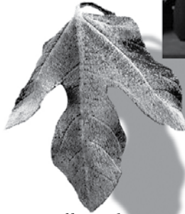
Fig Leaf by Emily DuBois from Intimate Apparel