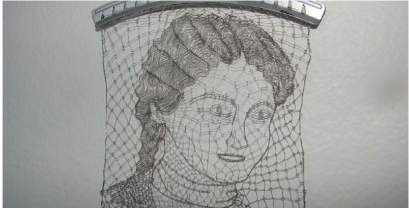
Family Hair by Karen Searle