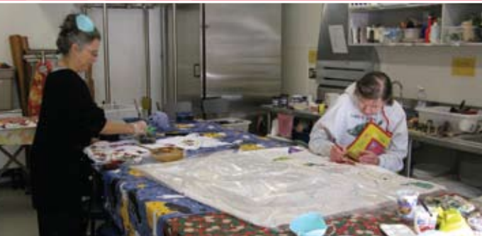
Textile Center Ellen Errede Wells Dye Lab