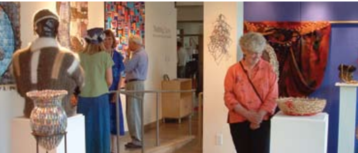
Textile Center Joan Mondale Gallery