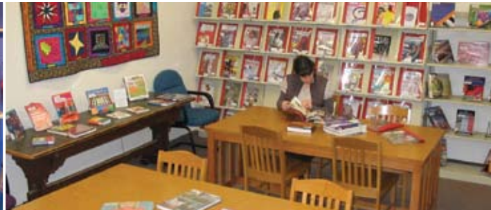
Textile Center Pat O'Connor Library